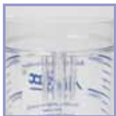
Euro Parallel Mount