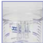
Euro Parallel Mount