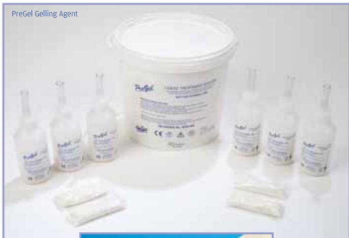
PreGel Gelling Agent