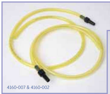
4160-007 & 4160-002