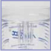
Euro Parallel Mount