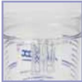
Euro Parallel Mount