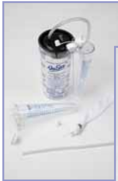
Tissue Collection Device