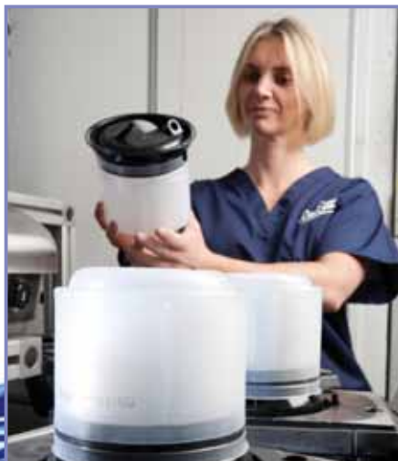
Manufactured in the UK to exacting standards.