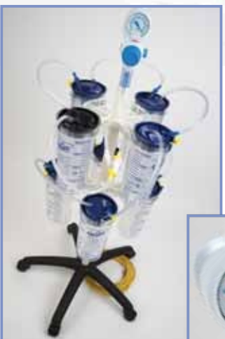
8V 2 Litre Cascade Stand set up