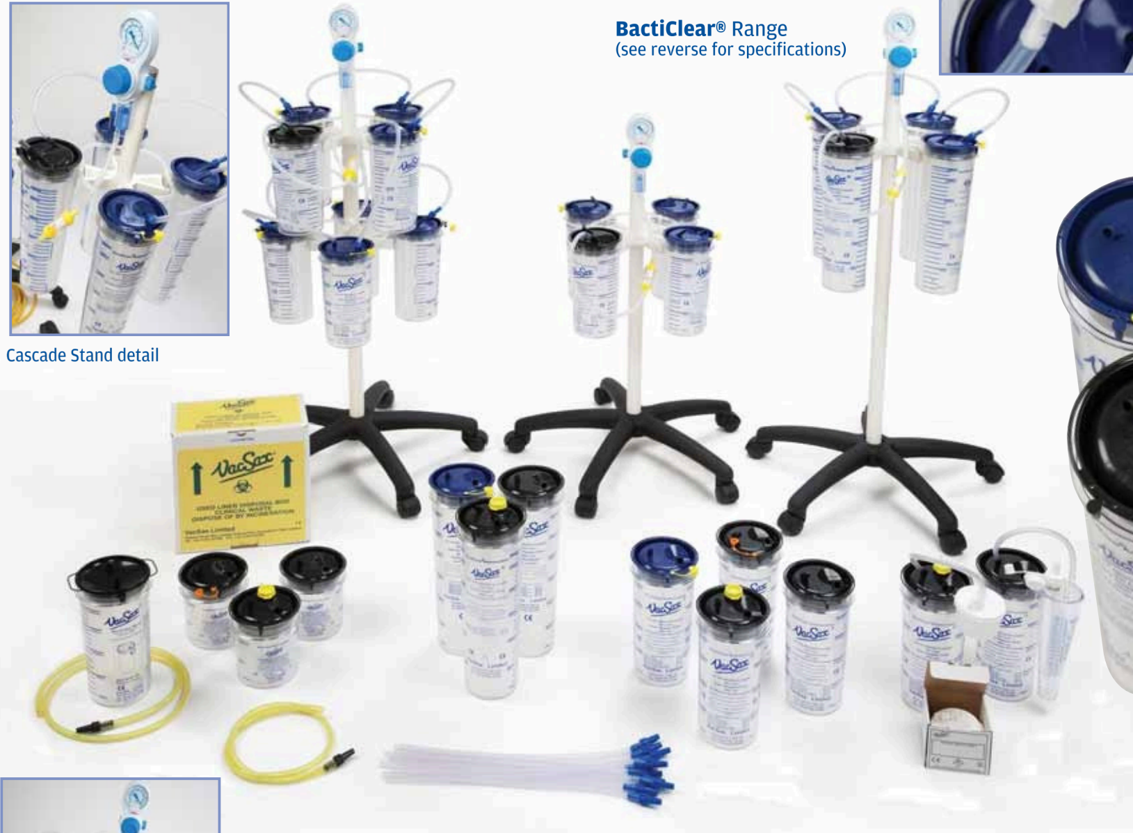
BactiClear® Range (see reverse for specifications)