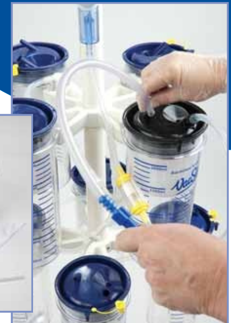
1, 2 & 3 Litre Liners and Canisters.