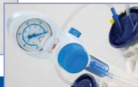
Cascade Stand detail