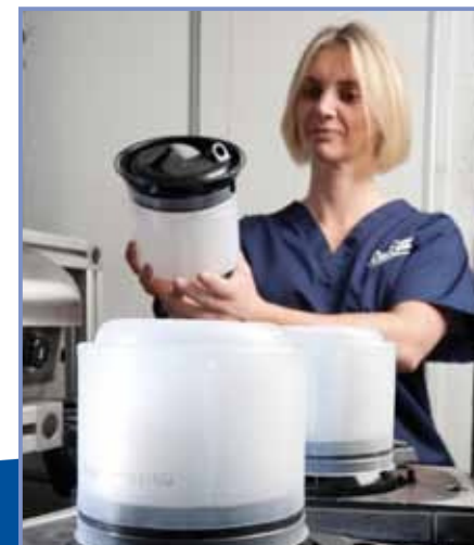
Manufactured in the UK to exacting standards.