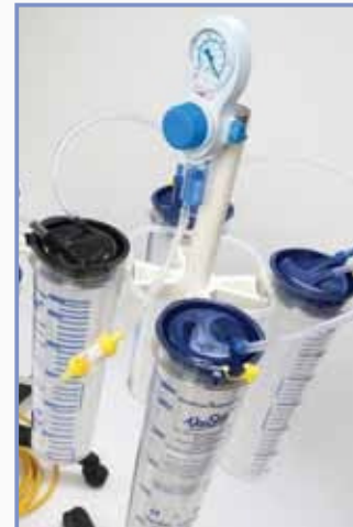
Cascade Stand detail

BactiClear® Antimicrobial Disposable Suction Range from VacSax® the product of choice